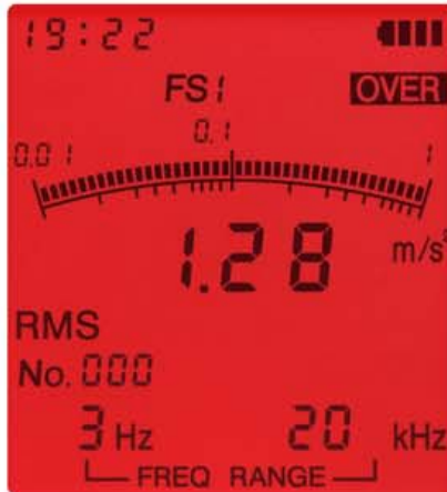
Overload indication screen