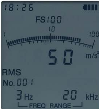
Measurement data display screen

The large LCD panel displays the bar graph meter and numeric reading at the same time, making it easy to visually evaluate any changes immediately. The display also shows the frequency range setting and other useful information. Backlighting can be turned on if required, allowing use of the unit also in dark locations. In case of overload, the indication "OVER" appears, and the entire display color changes to red.